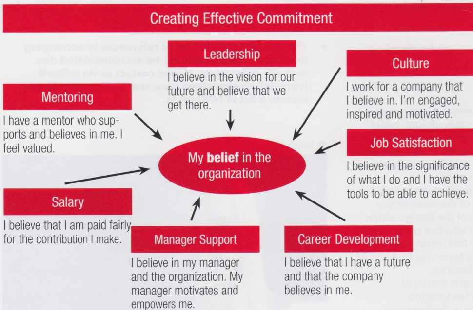
Figure 2: Importance of belief in creating affective commitment.

joining new companies, leadership soon becomes one of the key drivers of affective commitment, particularly as effective leadership drives the mission of the organisation, which in turn helps to shape the culture. It was also apparent that the more of these elements that are put in place, the higher the likelihood of creating affective commitment amongst the sales force.