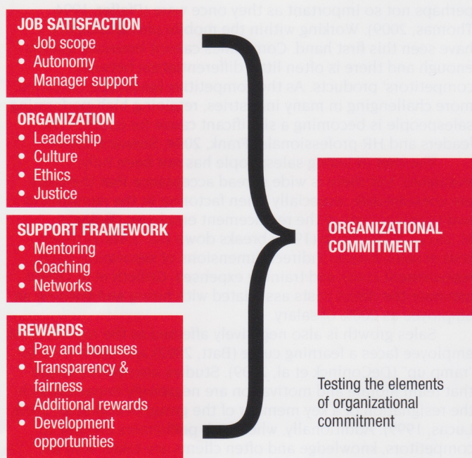
Figure 1: Factors in organisational commitment.

In an attempt to understand how organizational commitment is created, maintained and potentially renewed, I planned to investigate the importance and impact of the following factors on organizational commitment (Figure 1):